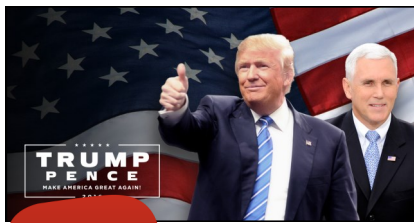
Mike Pence is the current vice president of the United States.