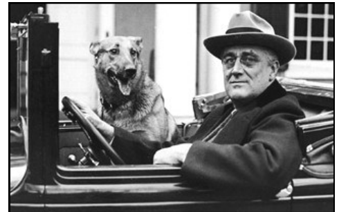
Before the 2-term limit, President Franklin D. Roosevelt was elected to four terms in a row! He took office in 1933 and died in 1945, a few months into his fourth term.

In the United States, presidential elections happen every four years. A president cannot serve more than two 4-year terms—a total of eight years. This rule is found in the 22nd Amendment to the Constitution, which was added in 1951. If a president has only served one term and wants to be re-elected, that president ends up spending a lot of time campaigning during the last year of the term. If the president has already served a second term, often the vice president will decide to become a presidential candidate. Many presidents started out as the vice president.