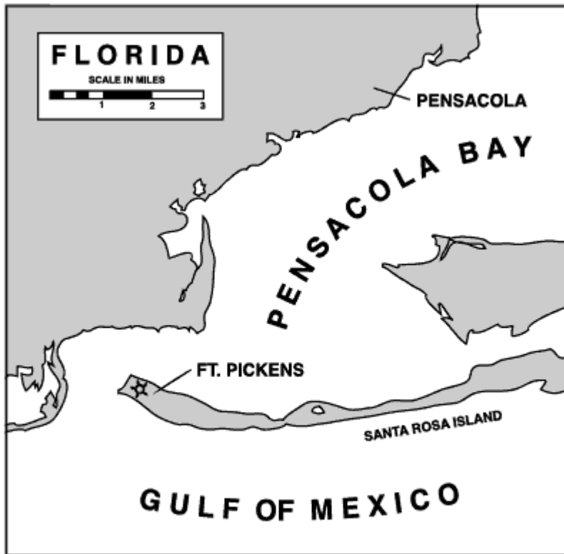
Union troops refused to leave Fort Pickens when Florida seceded from the Union.

differed in their view on slavery and loyalty to the United States. Not all southerners supported slavery, so they fought for the North, and not all northerners supported the war against the South. The border states between the North and the South had the most difficulties during the war.