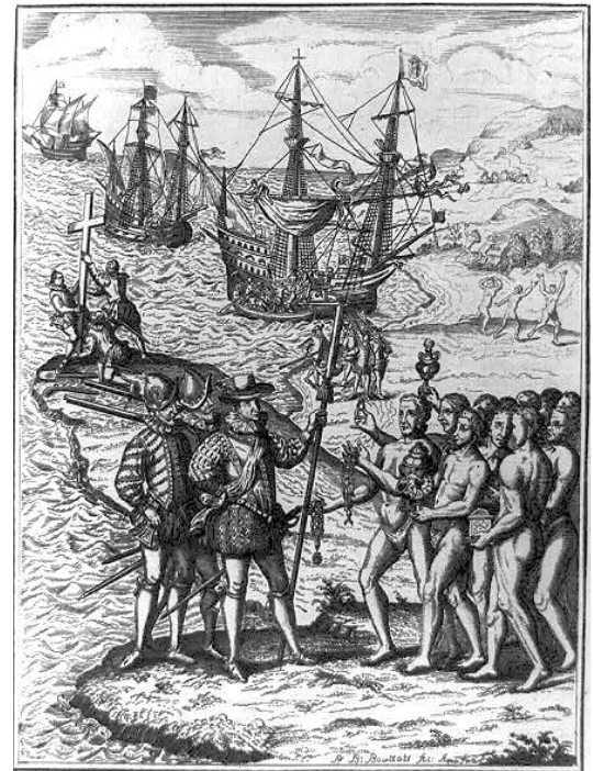
El Almirante Christoval Colon Descubre la Isla Española, y haze poner una Cruz, etc.

When Columbus landed on the island of Hispaniola (the island including the modern countries of Haiti and the Dominican Republic) during his first voyage in 1492, he and his men did not realize the lasting effects their voyage would have on both the New World and the Old at that time and in the years to come. The Columbian Exchange is the term given to the transfer of plants, animals, disease, and technology between the Old World from which Columbus came and the New World which he found. Some exchanges were purposeful — the explorers intentionally brought animals and food — but others were accidental. In this lesson you will read about this Exchange from a description written by Charles C. Mann, a writer specializing in scientific topics. This lesson uses excerpts from a book entitled 1493: Uncovering the New World Columbus Created in which Mann describes the effects, both intended and unintended, of the Columbian Exchange. Mann wrote 1493 to explore the Columbian Exchange as a process which is still going on today.