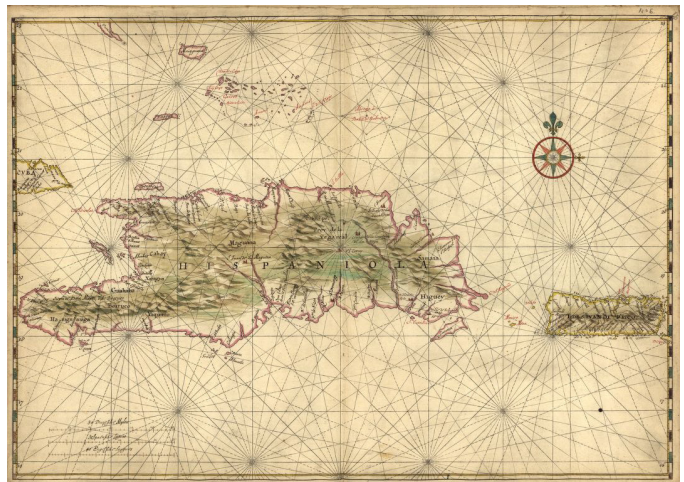
Joan Vinckeboons, “Map of the islands of Hispaniola and Puerto Rico,” 1639(?)