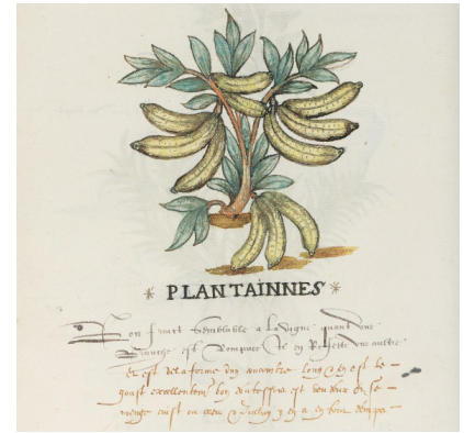
Plantainnes (Plantains), “Histoire Naturelle des Indes,” ca. 1586